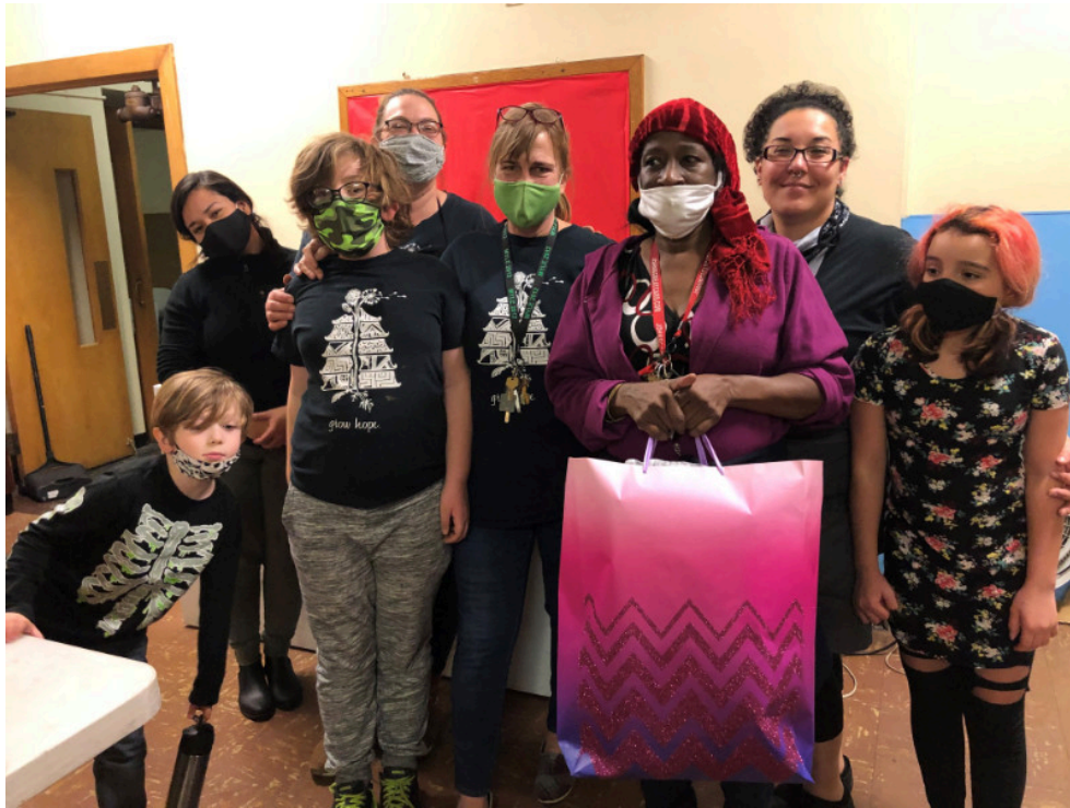
Food distribution staff at Hope

On Saturday, November 14, the Reading Chapter of the NAACP met for its 33rd annual Freedom Fund Gala - virtually, of course. Meals from "Grill Then Chill" were delivered to the homes of attendees. Following the meal, awards were presented to local organizations for their racial justice efforts. The Gala theme was, "We Are Done Dying."